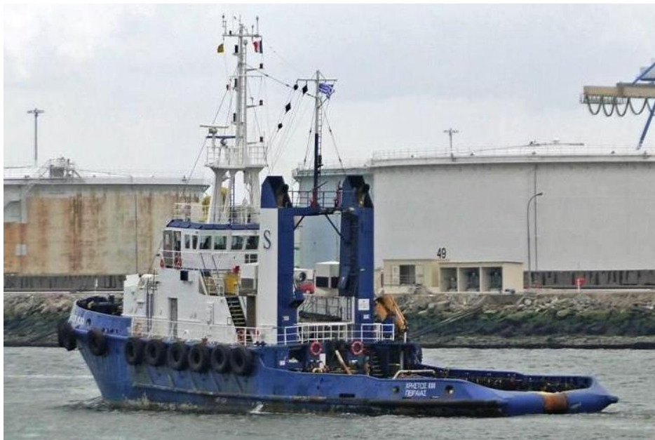
Figure 1: T/B CHRISTOS XXII.

The Port Pilot boarded her at 07:00. At approximately 07:15, the unberthing operation commenced. CHRISTOS XXII provided a 60m tow line, the one end eye of which was secured onto its towing hook, whereas the other end of the towline was received by the ship using a 30m messenger line connected with a ship's heaving line. The towline's eye was placed on a bollard located at the starboard poop deck. At 07:28 CHRISTOS XXII was made fast and waited for further instructions and the unberthing maneuvers. By that time HAMMERSMITH BRIDGE was moored alongside by her port side. At 07:36 her mooring lines were released from the dock and CHRISTOS XXII started pulling the vessel's stern away from the berth. At the same time HAMMERSMITH BRIDGE bow thruster was operated in order to clear her bow while the Main Engine was running at Dead Slow Ahead and she moved along the berth towards the open sea. During that time none of the tugboat's crew was standing on her deck. Almost 5 minutes later, at about 07:43, the ship was cleared from the berth and her Main Engine was stopped, in order to release the tow line.