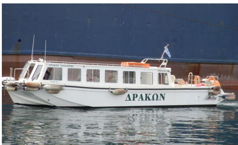
Name of vessel: DRAGON TAXIARCHIS Type of vessel: Passenger launch boat Year of built: 2010 Flag: Greek