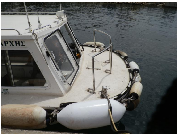
The fore embarkation deck of launch boat DRAGON TAXIARCHIS

When the launch arrived at Keratsini port the technician was placed in the ambulance, but the ambulance crew declared his death. According to the official postmortem report, his death was caused by myocardial infarction in extension of past coronary heart disease.