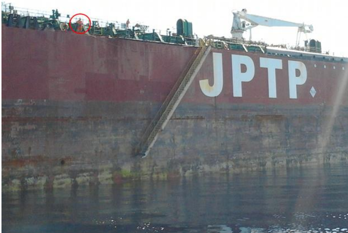
The Starboard accommodation ladder of M/T ROYAL OAK.