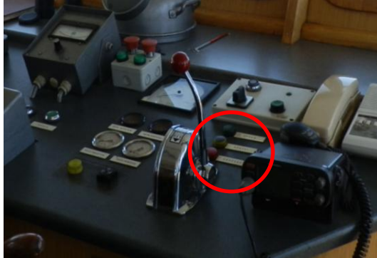
Picture 4: View of the direction drive control lever where the indicative position lights are shown (inside the red circle)