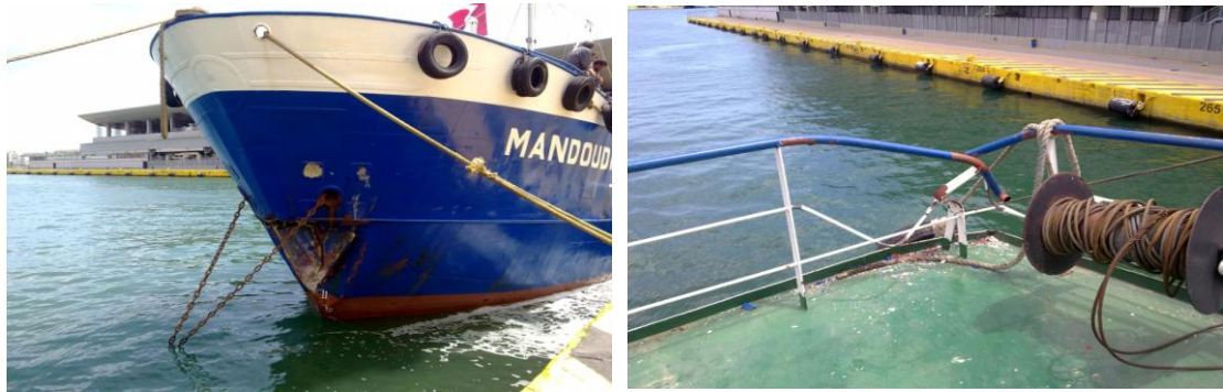
Pictures 2, 3: The damages of the M/T externally (left: fore part, right: railings on the starboard bridge deck)