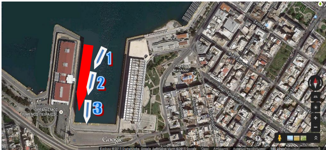
Picture 1: View of the area of Pier No.3 (Xaveri Coast) in the Central Port of Piraeus. The positions of the ships involved, SEABOURNSPIRIT (red) and MANTOUDI (white - blue) are shown (without the use of a scale) as follows: