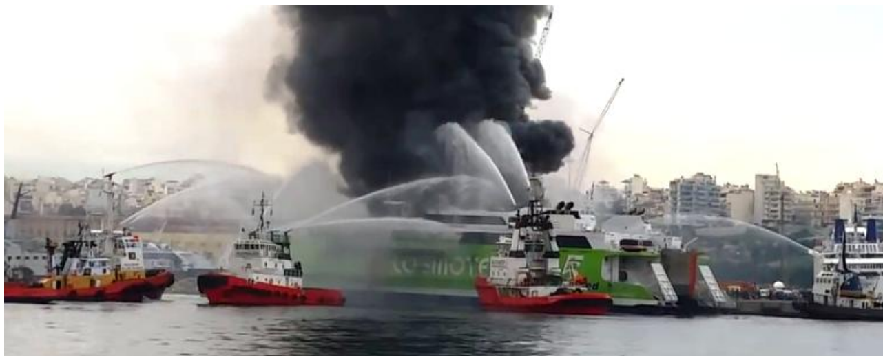
Figure 1: The deployment of the firefighting boats was imminent.

and Fire Squad teams were deployed at the dock, from the stbd side, whereas the local Coast Guard Authority members blocked the access to the accident area.