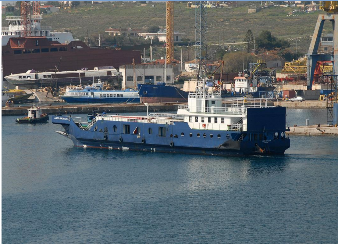
Figure 1: RoRo Cargo Agia Marina. The photo was taken by the time she was named Agios Nikolaos.