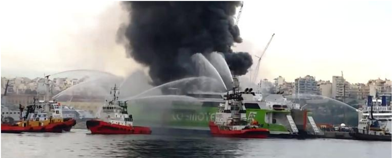
Figure 1: The deployment of the firefighting boats was imminent.

and Fire Squad teams were deployed at the dock, from the stbd side, whereas the local Coast Guard Authority members blocked the access to the accident area.