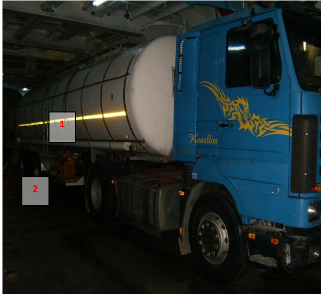
Picture 2: The tank truck parked at the point of the water supply, in the garage of the Ro-Pax "NISSOS RODOS". The ladder on the right side of the tank (1) and the place where the injured was found (2) have been marked.