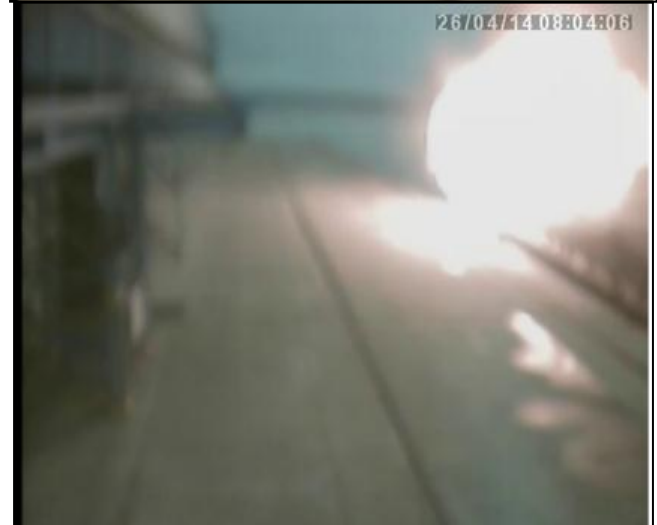
Photos from the explosion