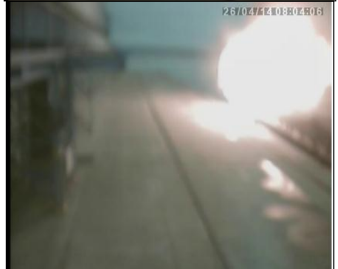
Photos from the explosion