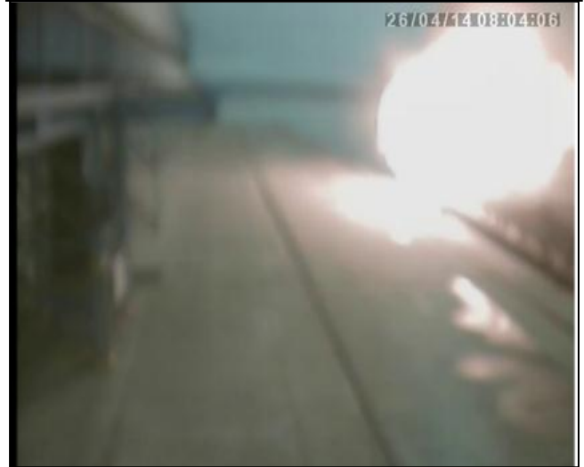
Photos from the explosion