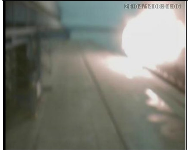
Photos from the explosion