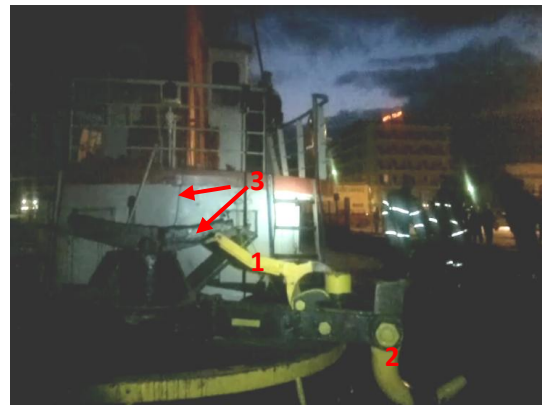
Picture 3: Arrangement of the quick release mechanism of ARTEMIS V. The releasing phases prior to activation (on the left) and past activation (on the right). 1: Hook fastening arm, 2: Towing hook, 3: Release wire from the coupled jointed arm to the bridge.