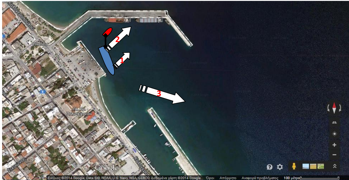
Picture 2: Schematic illustration of the maneuvering of JSM (blue vessel):