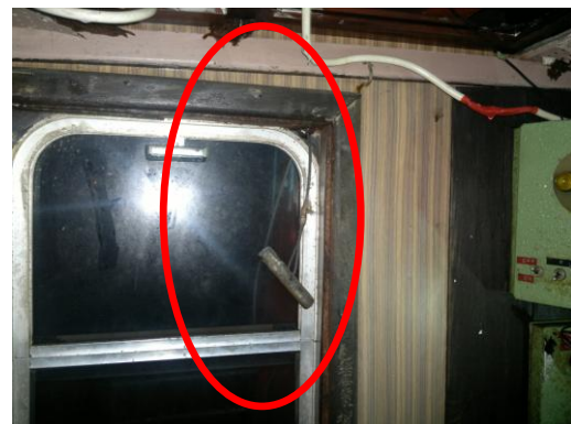
Picture 4: The lever release of the immediate release system of the tugs to the steering space of tug boat.

The Tug boat and Salvage Associations should inform their members regarding the importance of keeping watertight and weathertight openings of Tugboats in the closed position when engaged in towing operations and advise the conduct of tests of towline release mechanism by the tug's crew prior to towing operations.