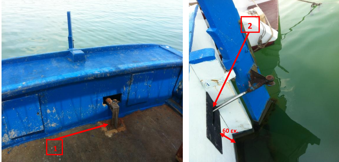
Picture 2: The bearing point of steering gear (1) and the point from which the rudder mechanism penetrated the hull of the ship (2).