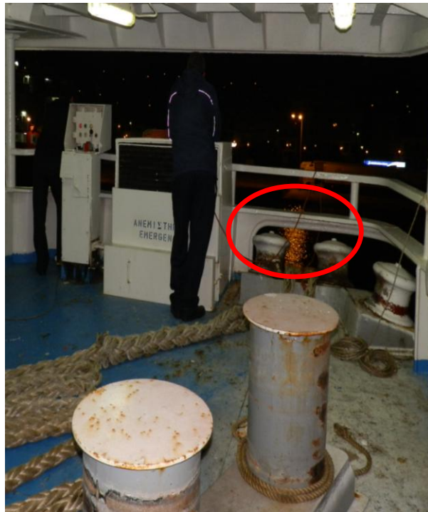
Picture 3: View of the left aft mooring deck space. Marked (circled in red color) the fairlead rollers through which the stern ropes passed which was the point where the seaman got injured.

In the examined marine accident, the aforementioned factors were not adequately evaluated; as a result the action of the seaman to get his hand between the rope and the roller in order to hold the suspension line of rubber pad, led to his injury.