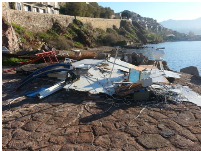
Photos from the vessel's total loss due to the sea conditions and the rocky coast and from her equipment parts which were recovered a few days after the accident.