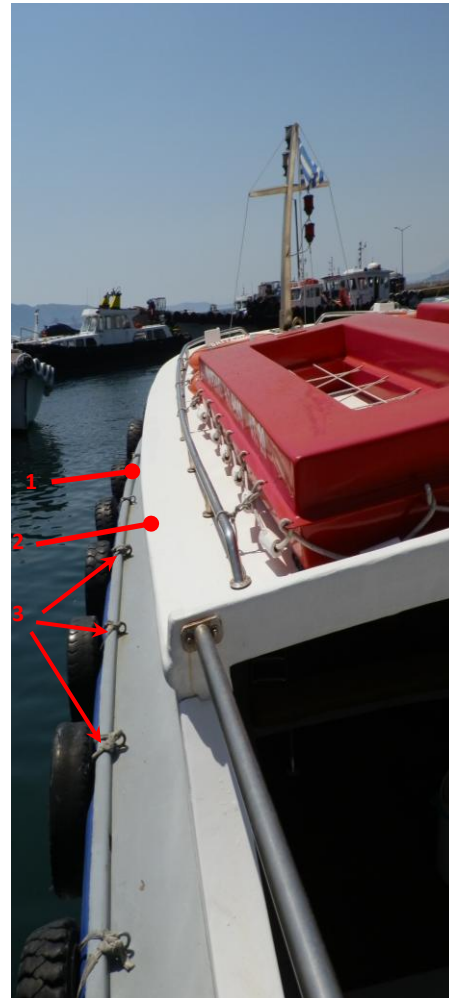
Picture 2: View from the stern of the left side deck of passenger launch. They are distinguished:

The Directorate of General Port Police and Regulations of the Ministry of Maritime Affairs and the Aegean should consider adding a provision in the General Port Regulation No 17 ("For launches' work"), so as to specify by signs or marks the spaces that are not accessible to passengers on passenger launches.