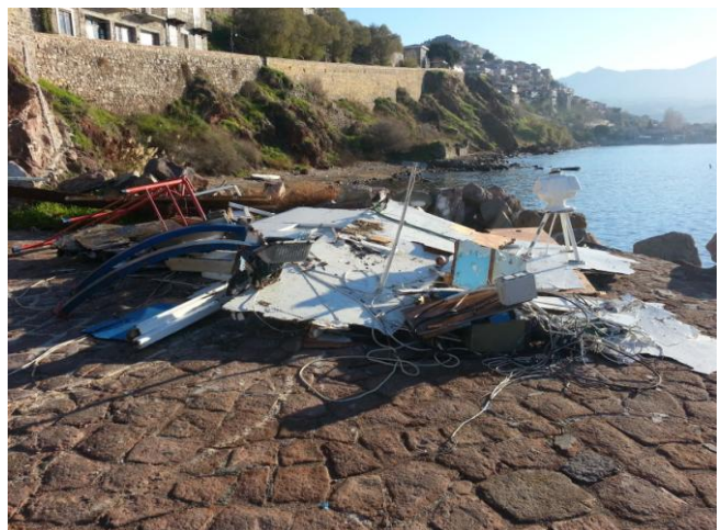
Photos from the vessel's total loss due to the sea conditions and the rocky coast and from her equipment parts which were recovered a few days after the accident.