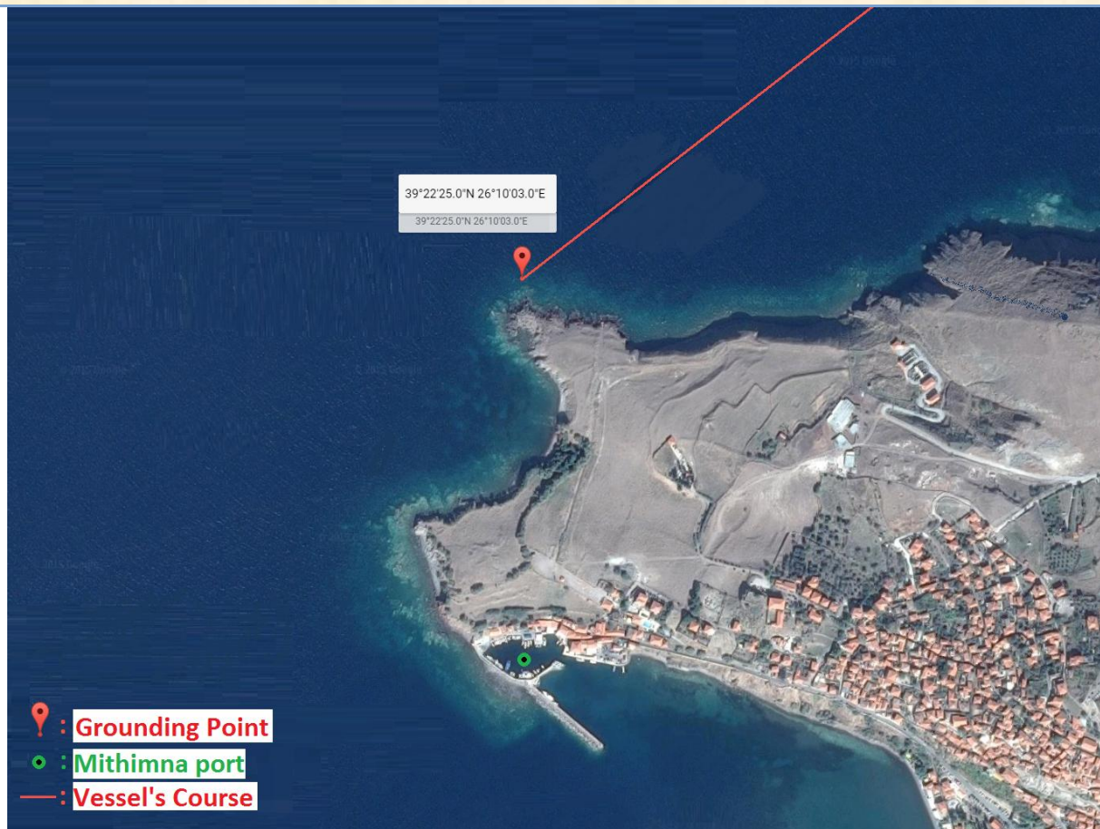
Grounding point of «AGIA MARINA» (Source: HCG/Safety of Navigation Directorate – Map Source: Google Maps)