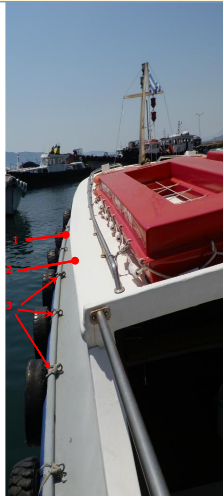
Picture 2: View from the stern of the left side deck of passenger launch. They are distinguished:

The Directorate of General Port Police and Regulations of the Ministry of Maritime Affairs and the Aegean should consider adding a provision in the General Port Regulation No 17 ("For launches' work"), in order to specify the terms and procedures for the passenger launches' skippers to report their intention to depart to the Port Authorities.