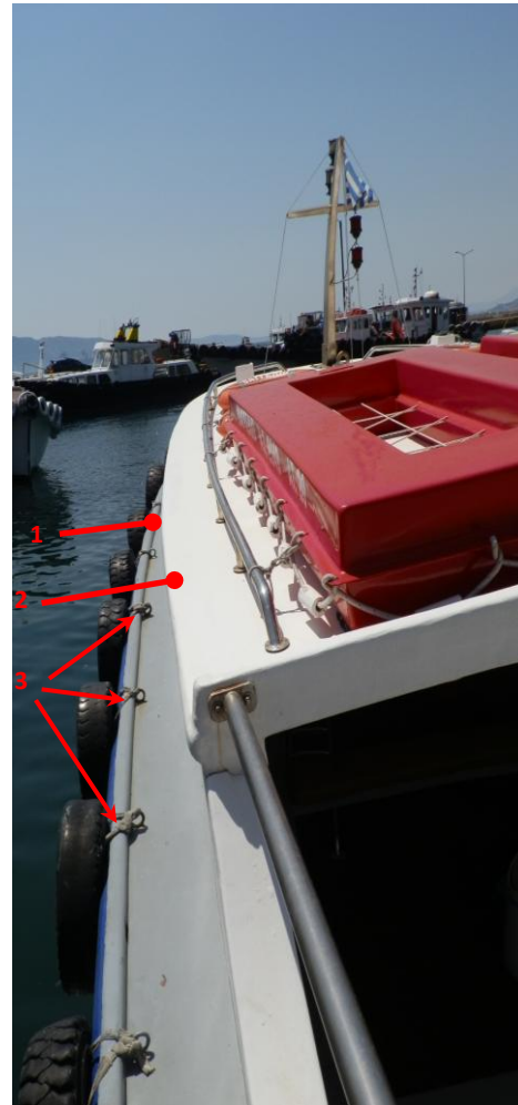
Picture 2: View from the stern of the left side deck of passenger launch. They are distinguished:

Moreover this review should comprise a relevant assessment for such operations to be carried out when the ship is moving.