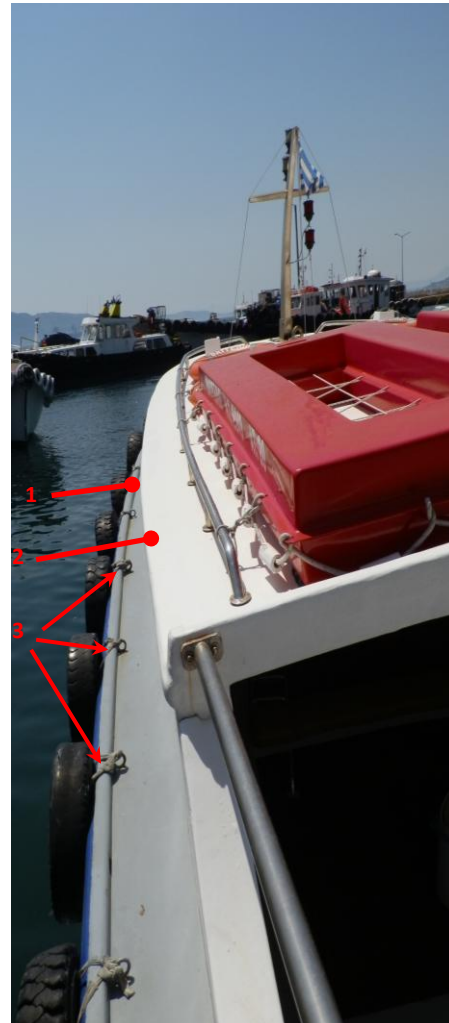
Picture 2: View from the stern of the left side deck of passenger launch. They are distinguished:

The launches' companies should make clear to the skippers that baggage or any other equipment collection should be considered as separate procedure from the embarkation of the passengers and therefore should be carried out as long as the weather conditions aloud in turns of crew and passengers safety.